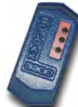
Pipe Locator Transmitter