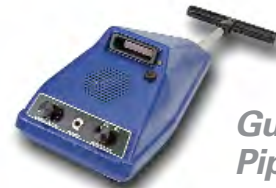
Gun Style Pipe Locator