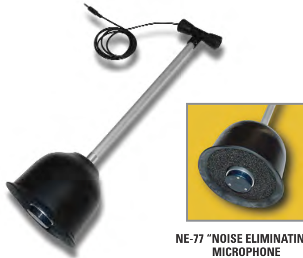
NE-77 "NOISE ELIMINATING" MICROPHONE

One year on manufacturing defects and workmanship