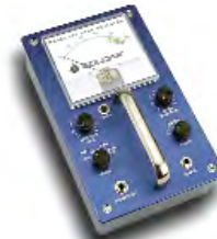
Complete 777- Leak Design